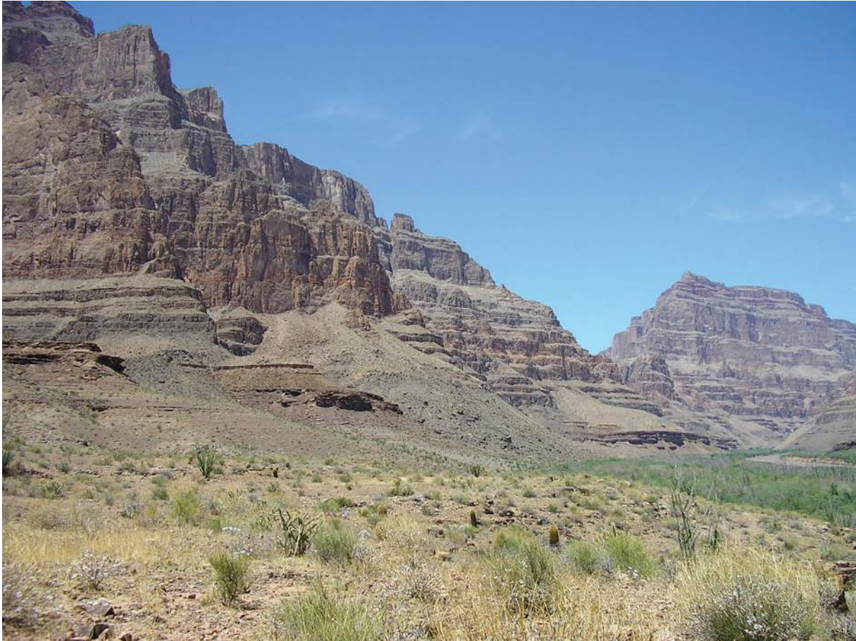
Part of the Mojave Desert